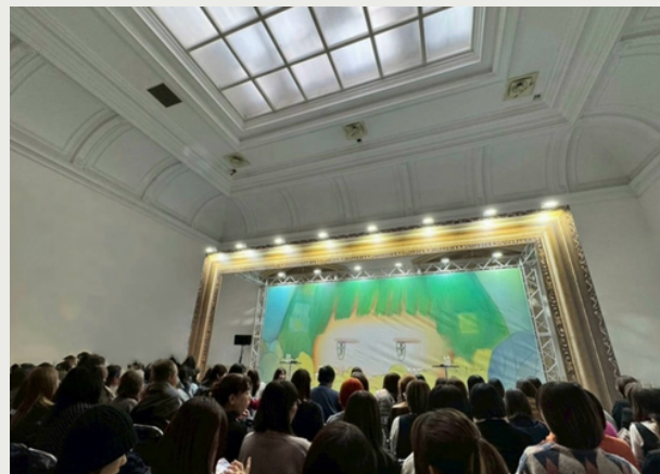
Yoshikatsu Ikeuchi Exhibition2025 MUSORY (Meiji Kotokan, Kyoto National Museum, Kyoto, Japan)