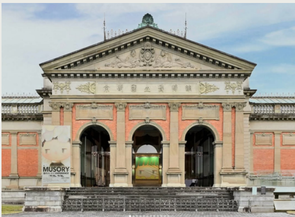
Yoshikatsu Ikeuchi Exhibition2025 MUSORY (Meiji Kotokan, Kyoto National Museum, Kyoto, Japan)